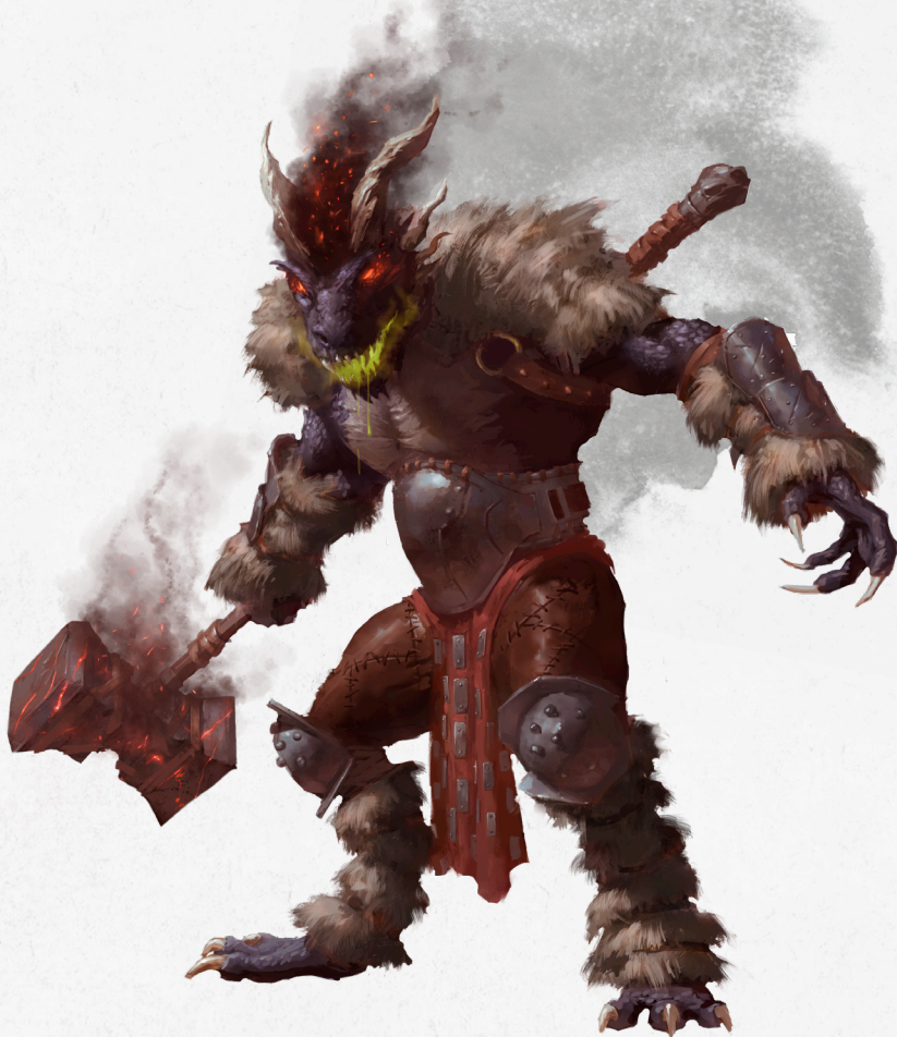
PATH OF NIGHTMARES