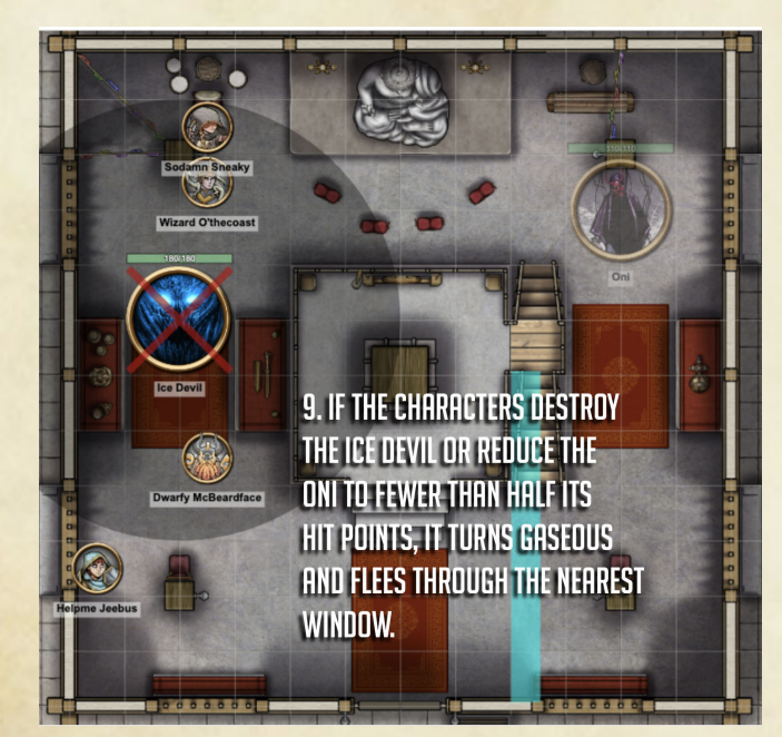
Round 5 diagram.