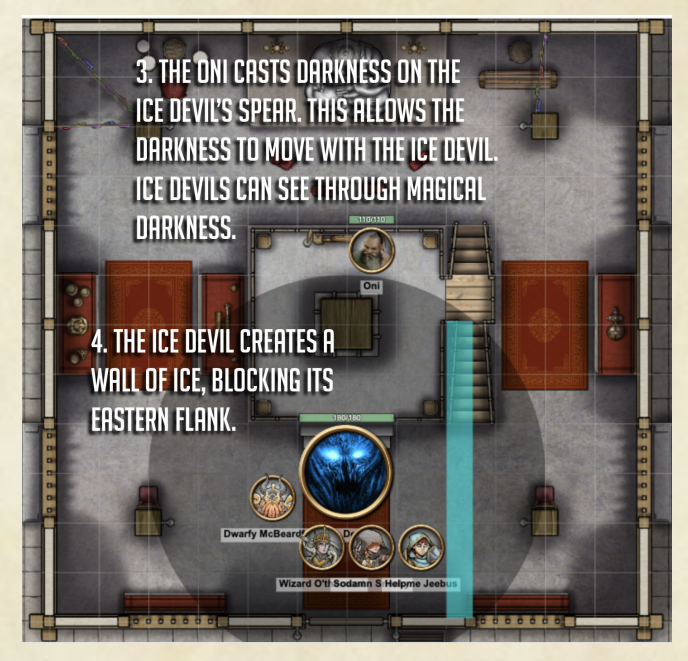
Round 2 diagram.

9. The oni saves itself. If the characters destroy the ice devil or manage to reduce the oni to half its hit points or fewer, the oni retreats. It uses its gaseous form and escapes through one of the pagoda's barred windows.