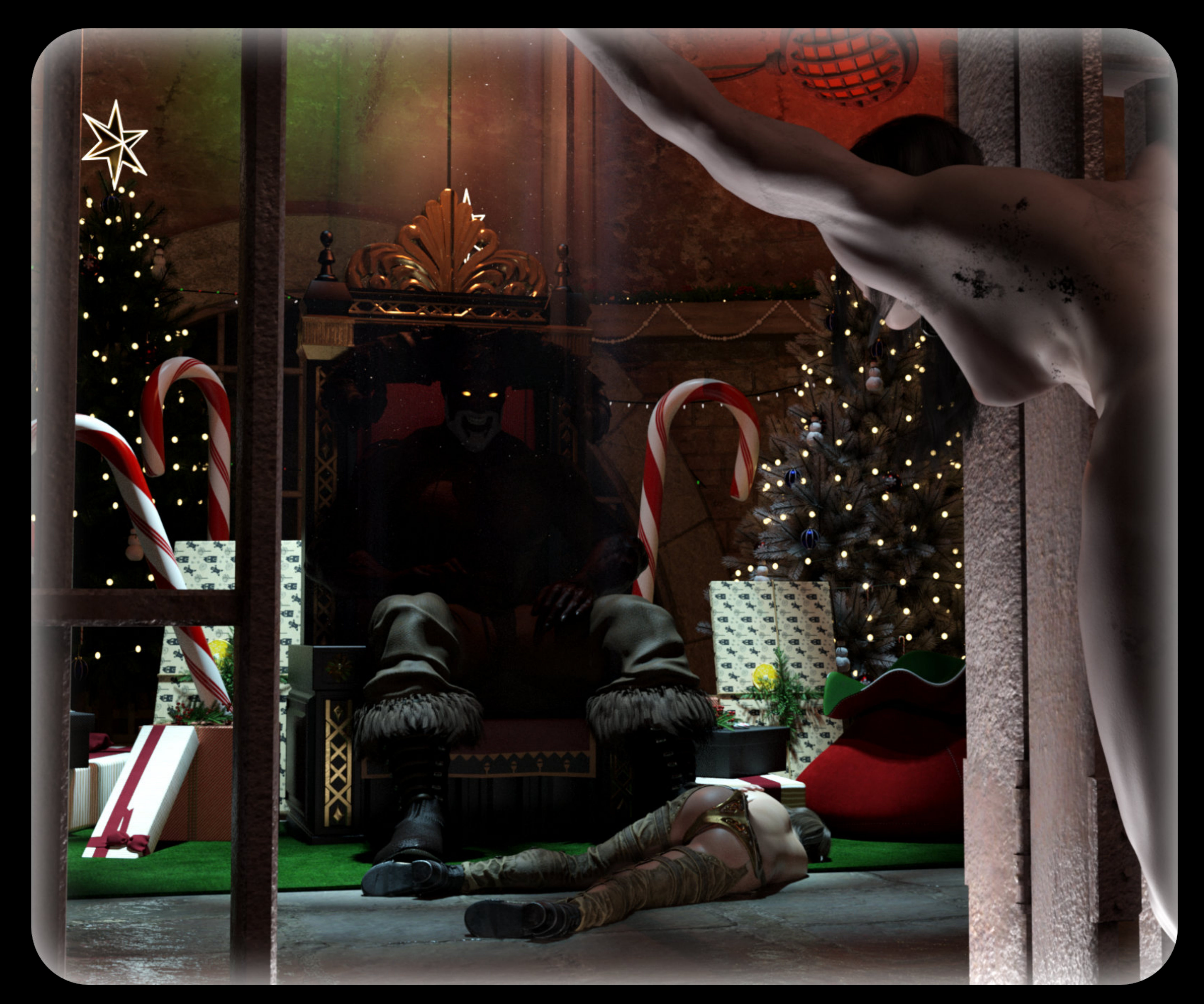
As I looked up, I was shocked at what I saw!

The beast sat upon a golden throne, surrounded by packages and garish decorations. The lights of the room slowly pulsed from color to color. Red and green. For a creature of the underworld, it was a strange sight to behold.