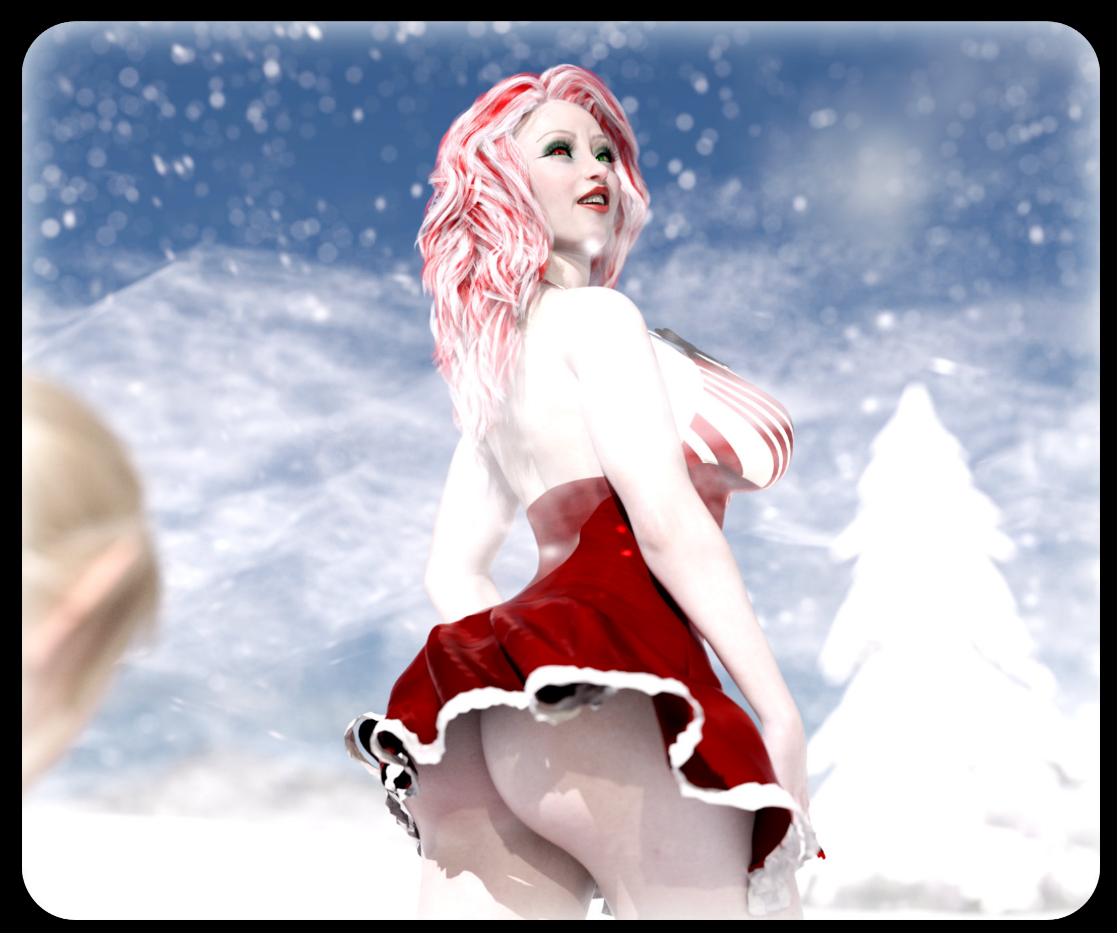
And so, that's the story of how we came to be here – in this Northern realm of man. Happy, horny and full of joy.

We work through the day to build gifts, to fill the emptiness and greed within mankind and then as the sun goes down we work to fill the needs of ourselves and each other. Christmas is, afterall, a time for giving and receiving.