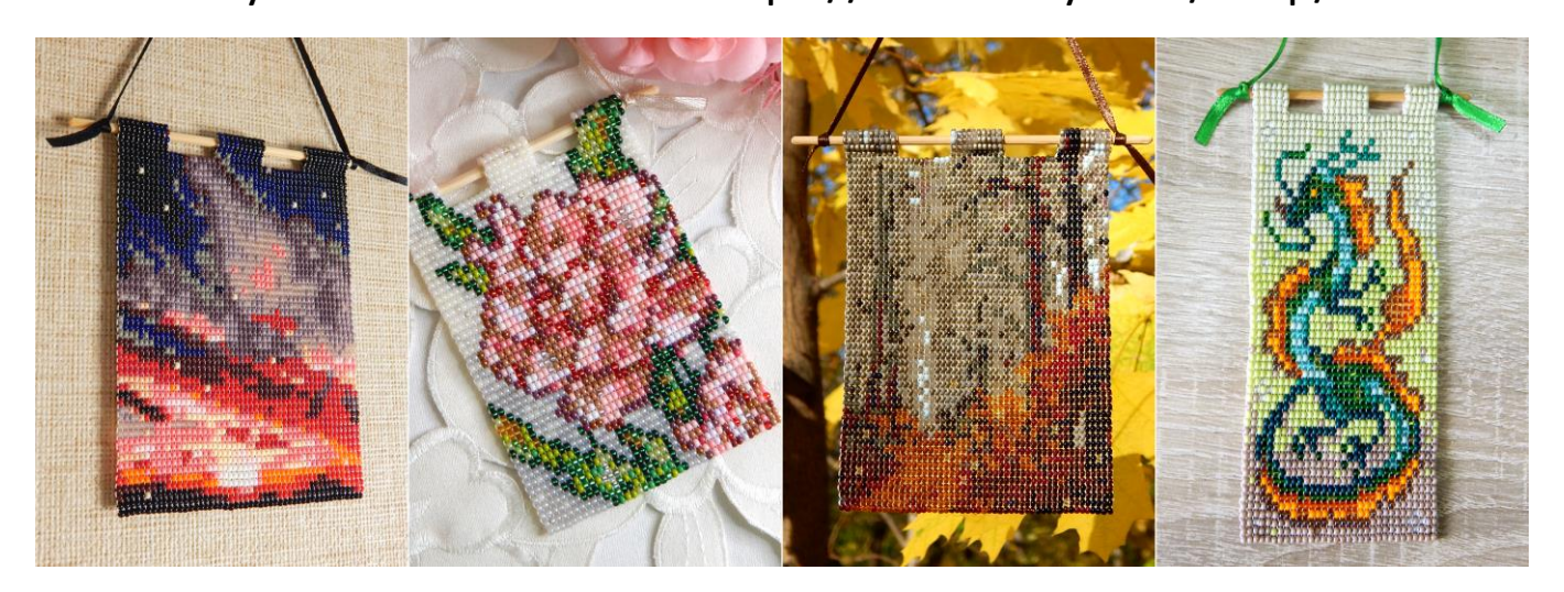
Thank you for your choice of my products and purchase! Have a good beading! ♥