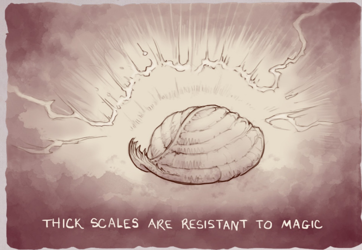
HANDOUT 2. THICK PEEL