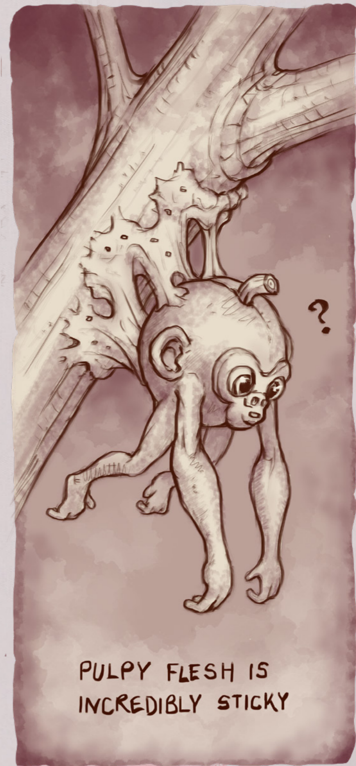
HANDOUT 3. STICKY PULP