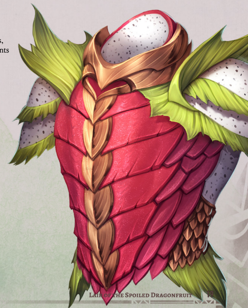
LAIR OF THE SPOILED DRAGONFRUIT