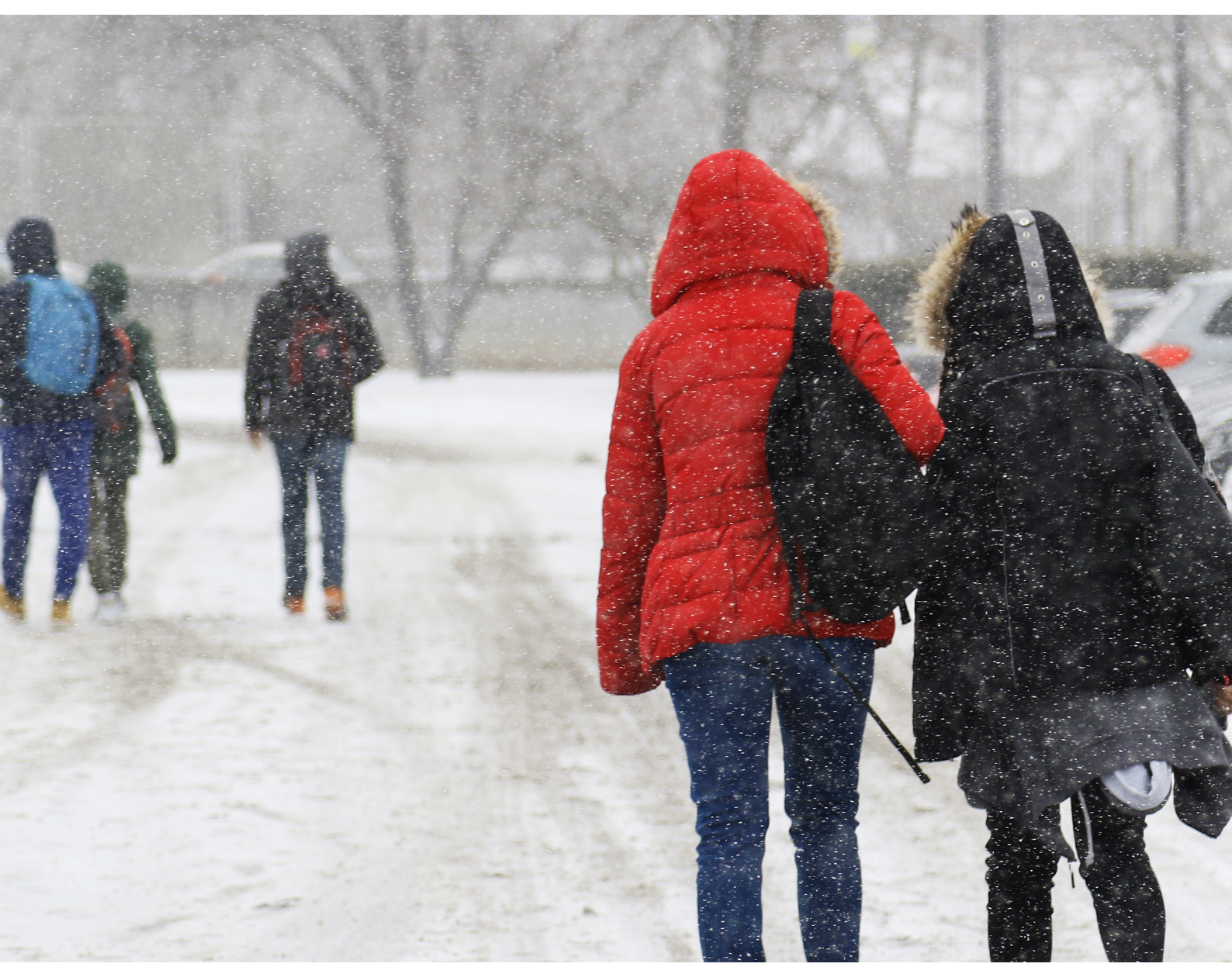
We live in San Dimas, there isn't actually any snow when we come back after Winter Break. ${\rm PHOTO}\ {\rm BY}\ {\rm EDWARD}\ {\rm OU}\ /\ {\rm TEEN}\ {\rm HIGH}