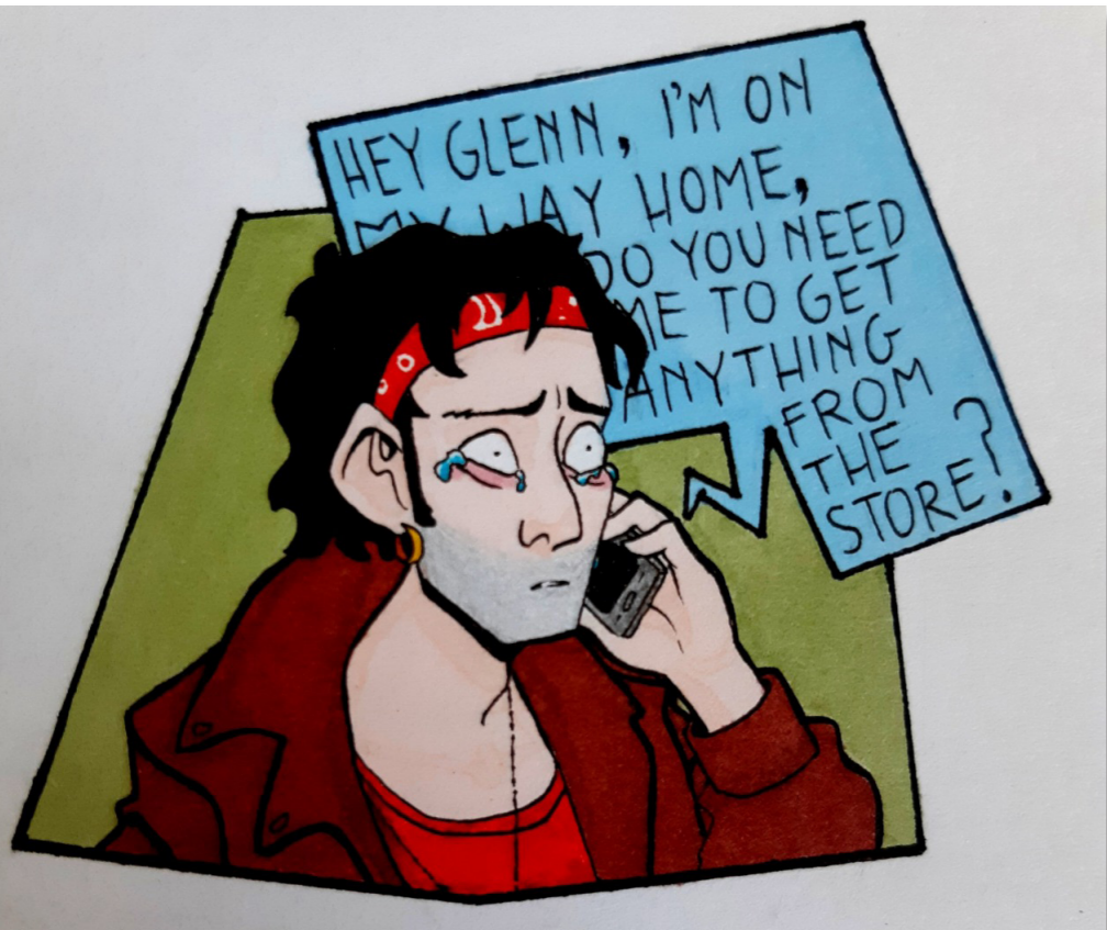
ABOVE: Paedon, by @gryzdolnik on Tumblr RIGHT: Glenn gets a call from Morgan, by @navoika on Tumblr