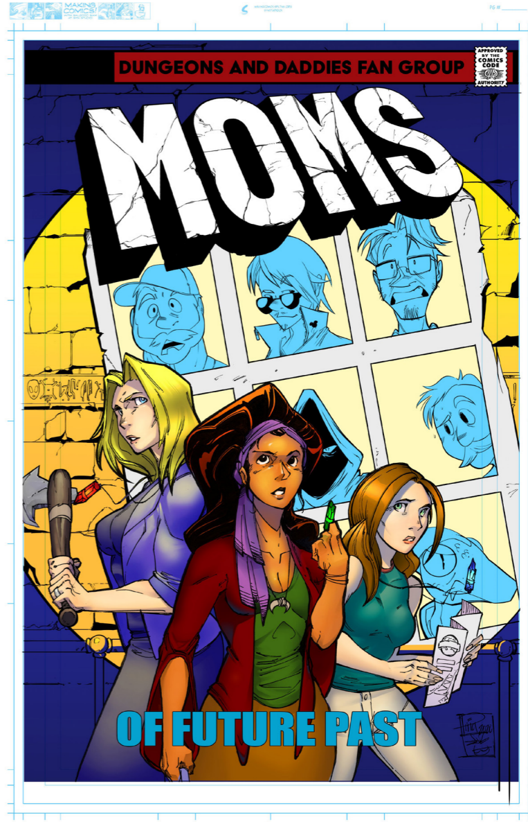
RIGHT: Moms of Future Past by @joshpineapple1 on Twitter