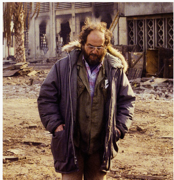
Part Set, Part Location = Slocation

Thanks so much for your support! Every little bit helps me in my quest to make more videos exploring filmmaking and film history. As you can probably tell from some of my videos, I love traveling to the filming locations of my favorite movies. This is a 10-question quiz to see if you can recognize some of the most iconic movie locations as they appear on Google Street View. I've actually visited five of the locations in this quiz and I highly recommend checking them out if you ever find yourself nearby. There's something so fascinating about standing in a place that has been given a strong fictional meaning and it's amazing to see that many of these locations have remained mostly unchanged since being involved in productions that took place decades ago. In the