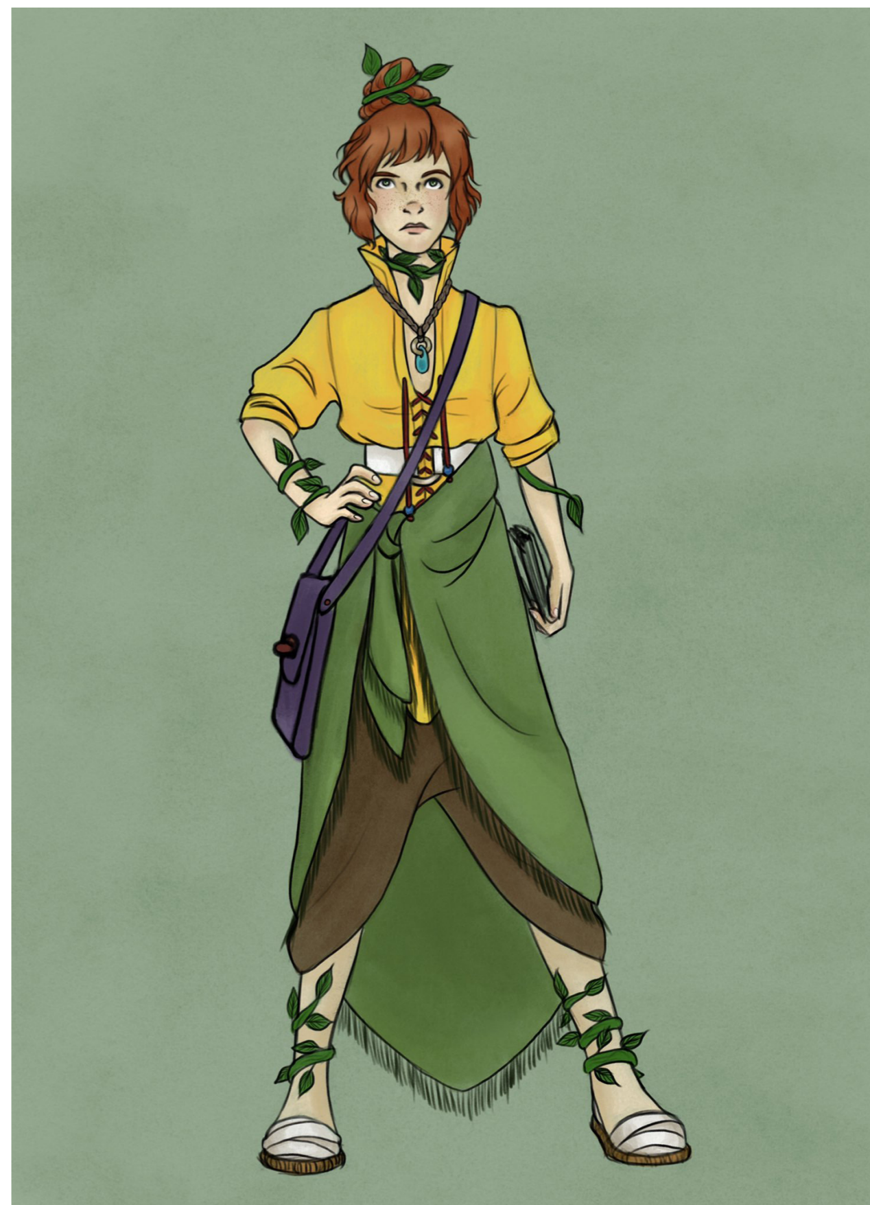
Artist: Beth Tredway, @bethredway (Twitter & Instagram)