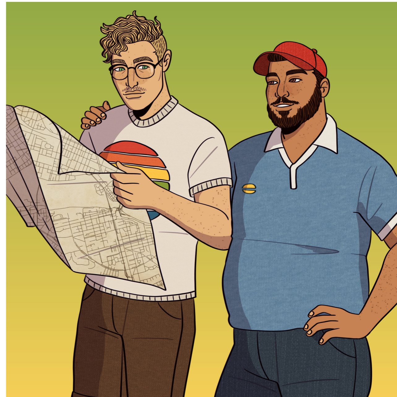
Artist: Miles Lazarus, @rabdoidal (Twitter)