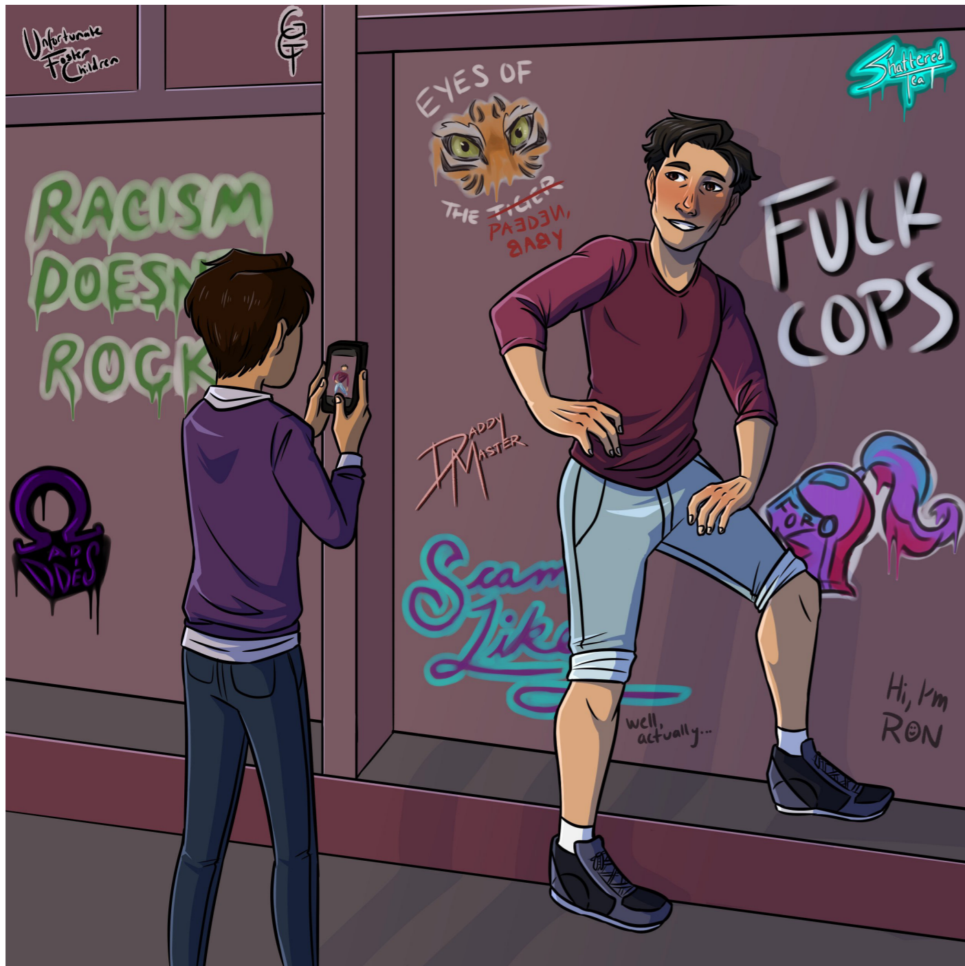
Artist: @shattered_tea (Twitter)